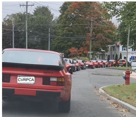
Rural Fairfield/Litchfield County Roads