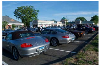
Glastonbury to E. Windsor