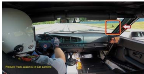
Watkins Glen 6/14/21