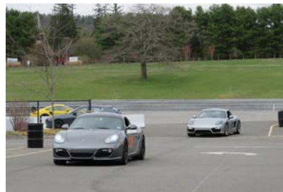
Solo DE 4/12/21