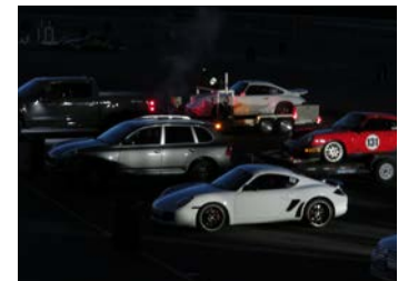
The LRP paddock 11/6/21 in the early morning