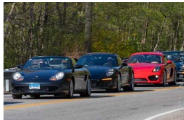
Guilford to Old Lyme