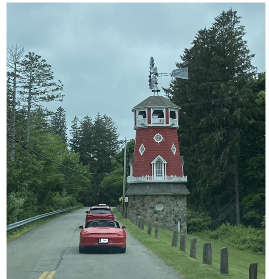
Windmill Coffee Run